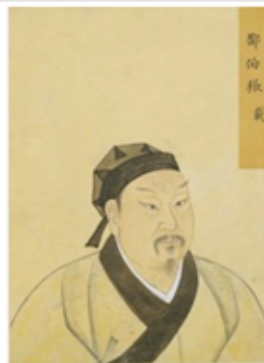
Zhang Zai (1020-1078) – Qi Xue (The Study of Qi)

Balancing measures create spaces that enhance well-being, health and performance.